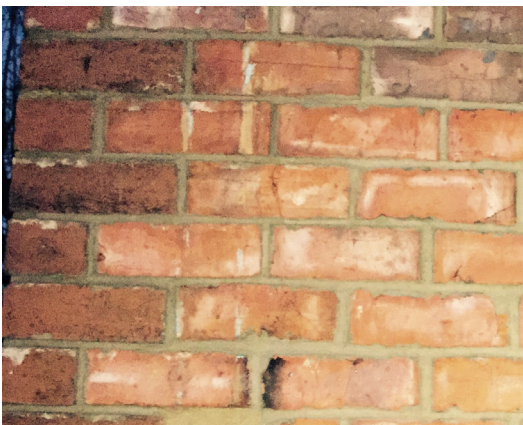
Existing bricks - Rear house wall

Reclaimed wire-cut bricks to be used – type similar to existing rear of house. Samples available to view on site.