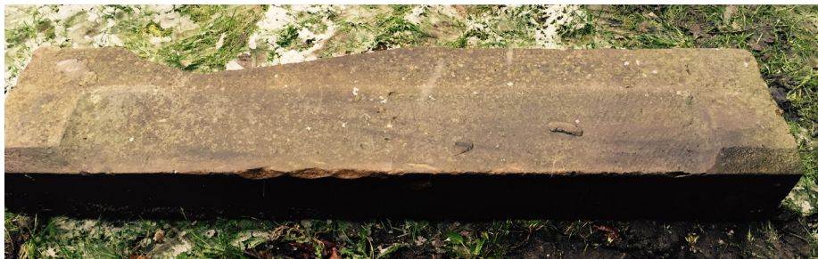
Proposed Sill / Header type

Reclaimed sandstone sills + headers to be used – similar type to those used on house .Samples available to view on site