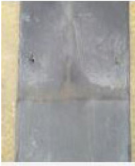
Proposed Slate type- Garage roof

Reclaimed Welsh slates to be used – samples available to view on site prior to start of construction