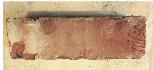
Proposed brick type - Garage wall (sides)